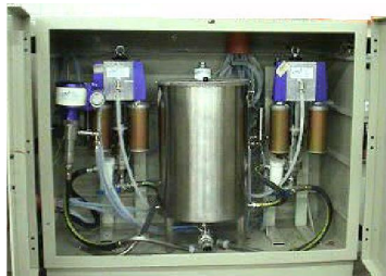
Feeding Group for the guns

Electrostatic system for water based paints, with insulation and medium pressure feeding.