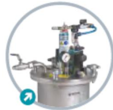
mit Druckluftförhrwerk / with air-powered agitator