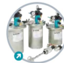
Weitere Größen plus Druckluftförhrwerk Further Sizes with Air-powered agitator

This innovative concept for configuring pressurized tanks makes for flexible integration into the customer's production operations. The tanks form a "building block" system so that a large number of optional accessories can be attached. Examples include agitators, fill level gauges and cover lifts. The fact that we have these items in stock enables dispatch at short notice. The containers are manufactured from stainless steel and are available in several standard sizes. All the tanks are equipped with quick closures (swing-bolt fasteners).